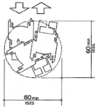
(a) 60-in (1525-mm)-Diameter Space

1 accessible route) & 4.2.3 (“The space required for a wheelchair to make a 180-degree turn is a 2 clear space of 60 inches diameter (see Fig. 3(a)) . . .”). Figure 3(a) illustrates the latter turning 3 space.